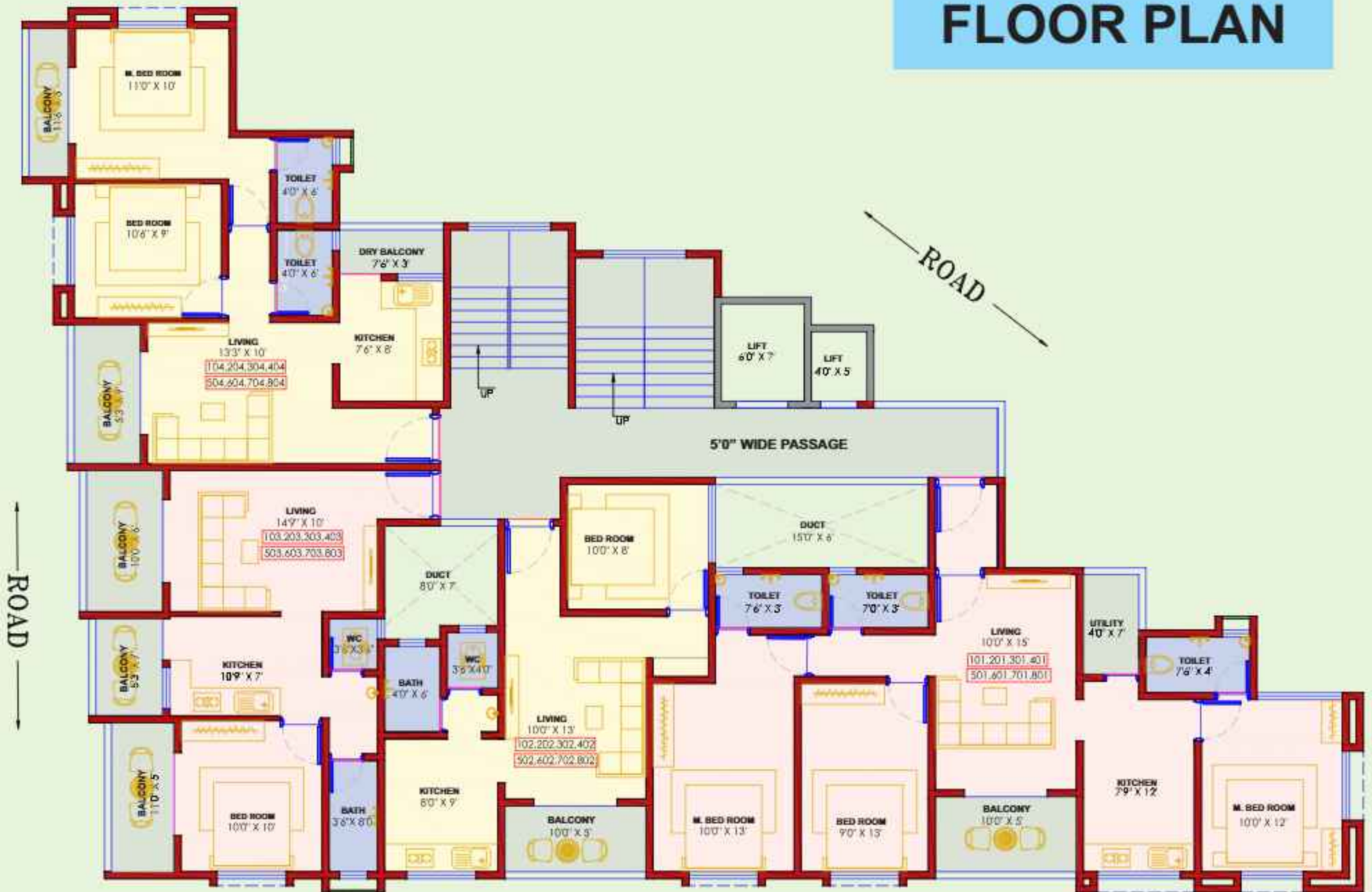
TYPICAL 1ST TO 8TH FLOOR